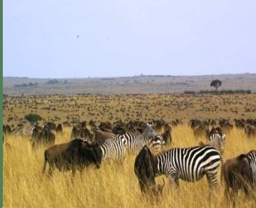
Day 18/35: Return to Nairobi

Explore Nairobi and prepare for Masai Mara