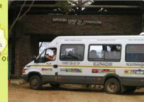
Day 21-22/35: Reach Dar es Salaam

Dine out at Old Farm and eat only organic food