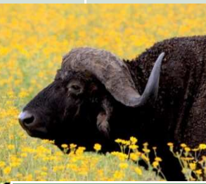
Day 26-27/35: Leave Tanzania / Enter Malawi

Dine out at Old Farm and eat only organic food